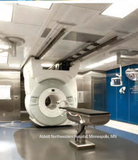
Abbott Northwestern Hospital, Minneapolis, MN

IMRIS neuro advanced surgical imaging solutions