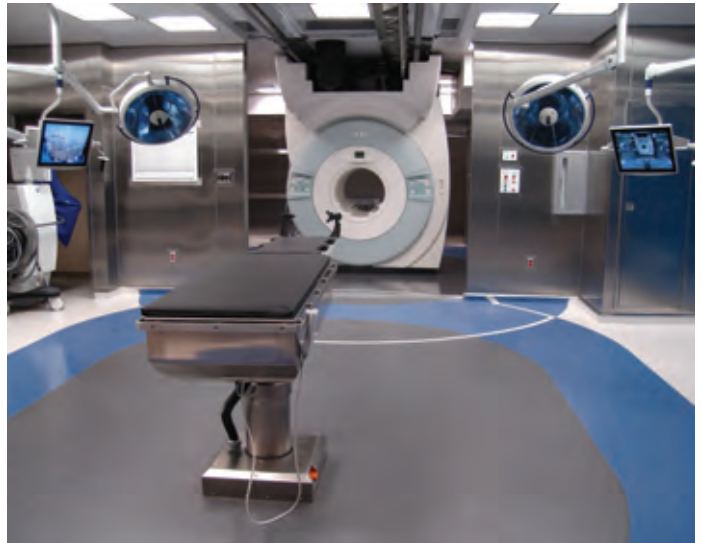
Figure 1: A Ceiling-rail-mounted 1.5 Tesla Cylindrical Bore System with the Scanner about to Enter the Operating Room

Boom-mounted lights, displays, and image-guidance equipment are positioned outside the 5 Gauss line. Dark gray floor tiles denote the 50 Gauss line and blue floor tiles denote the 5 Gauss line. A three-pin Doro head frame is shown in the surgical position at the end of the magnetic resonance compatible surgical table.