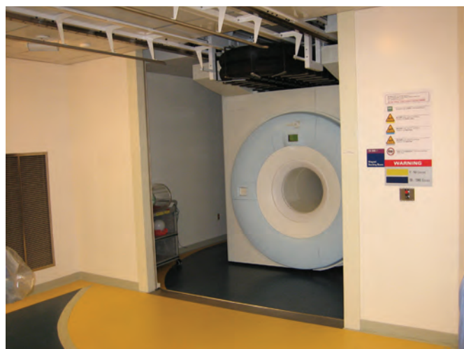
Figure 1: Movable Magnet/Stationary Patient System

The relative advantages and disadvantages of a stationary magnet/movable patient system are similar to those for a movable magnet/stationary patient. One potentially beneficial difference with utilising a movable patient platform is the opportunity to include multimodal imaging all in a single operative suite such as positron emission tomography and biplanar fluoroscopy. The disadvantages of this arrangement are also similar and relate largely to the safe docking of the anaesthetised patient within the magnet bore, inherent issues