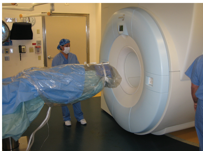
Top: operating room with the movable magnet in its garage. Bottom: magnet being moved into imaging position around the draped, anesthetized patient.

The fundamental concern that is common to both types of systems is their reliance on the preoperative imaging. It must be noted that these baseline images occur before positioning for surgery, opening of the craniotomy, loss of blood and cerebrospinal fluid (CSF), and any resection. Thus, the accuracy of these systems can be significantly affected by brain shift, which refers to the intra-operative movement of intra-cranial anatomic structures resulting from a variety of actions including position changes, CSF egress, and mass resection. 9 The actual amount of brain shift can vary depending on the tissue type of the lesion, patient positioning, size of craniotomy, CSF loss, and volume of tissue resected. 10 Thus, as the surgical procedure goes on, the accuracy of these types of navigation systems erodes over time.