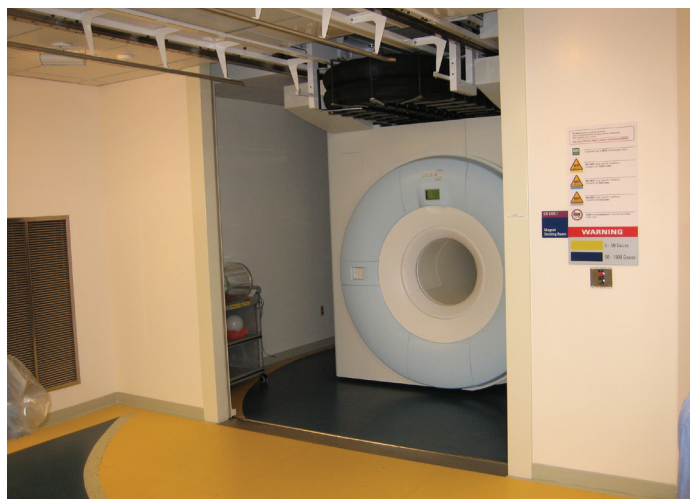
Figure 1: Movable Magnet/Stationary Patient System