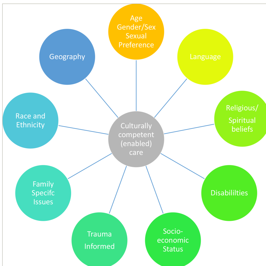
Figure 2: Components of culturally competent (enabled) care

Although most healthcare disciplines are encouraged to provide culturally competent care as part of ethical practice, this is often not well translated into clinical practice. When making clinical recommendations, it is important to consider the individual patient's cultural components, including age, gender, race and ethnicity, language, culture (including family-specific culture), socioeconomic status, sexual orientation and preference, religious/spiritual affiliation, and disabilities and stage of the disease. 30 Geography also plays a large part in the delivery of care; health services may be impacted by internet connections and limitations for travel once patients become less mobile. Figure 2 is a summary of the contributors to culturally competent or enabled care. Personal preferences and patient choice are key aspects of personalized medicine delivery and an integral part of the recently proposed 'circle of personalized medicine' and the previously proposed 'personalized medicine in non-motor PD'. 30,31